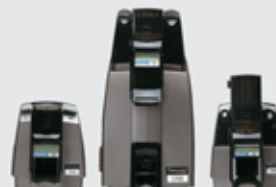
Datacard® card printers

Datacard® card printers deliver brilliant, full-color cards with your choice of smart card personalization, magnetic stripe encoding and inline application of protective and holographic laminates.