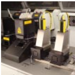
Vision Registration and Laser Engraving Modules