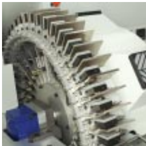
Smart Card Personalization Module